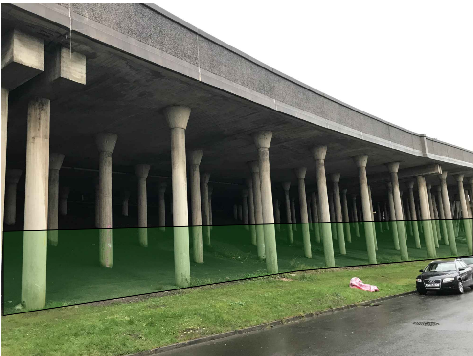
PHOTOGRAPH 2: GENERAL VIEW OF SPAN 4 WITH PROPOSED FENCING.