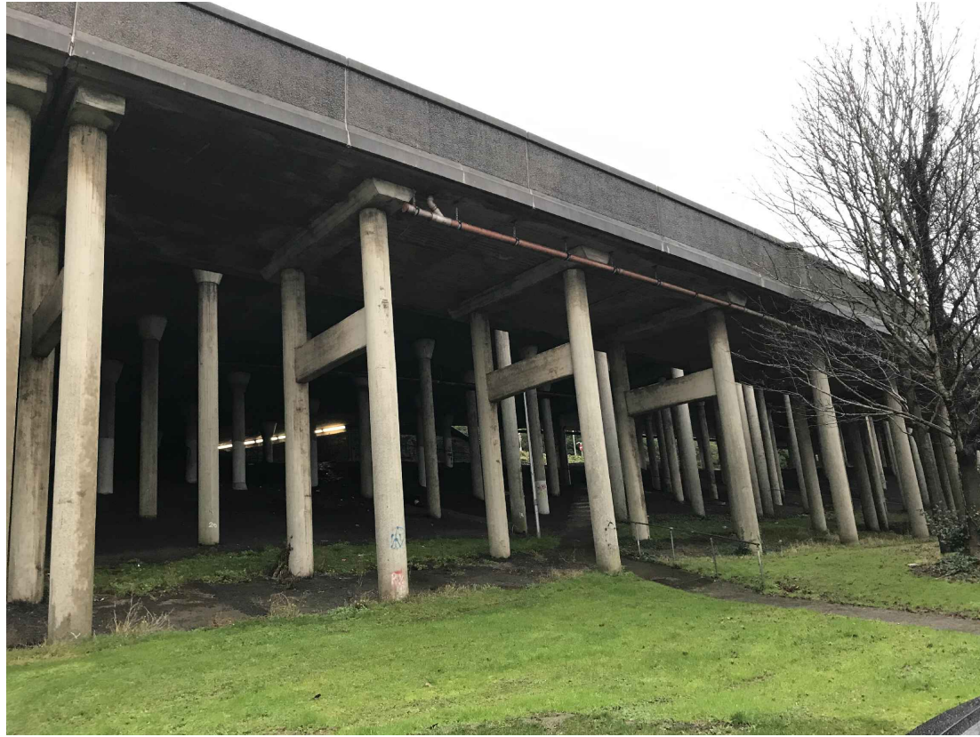
PHOTOGRAPH 3: GENERAL VIEW OF FOOTPATH TO REMAIN OPEN FOR PUBLIC ACCESS BELOW SPAN 7A/B OF LLEWELLYN ST VIADUCT.