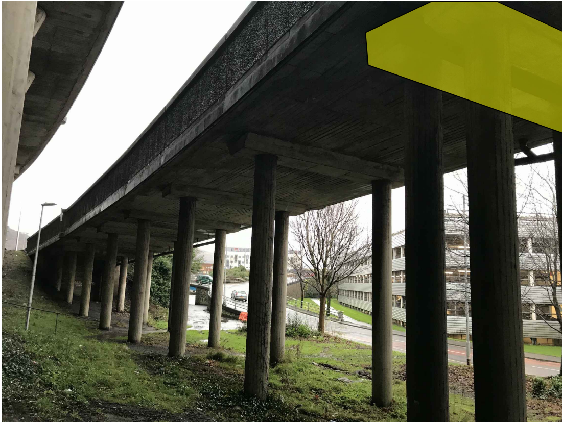
PHOTOGRAPH 2: GENERAL VIEW OF SPAN 8B SLIP ROAD, ADJACENT TO THE FOOTPATH.