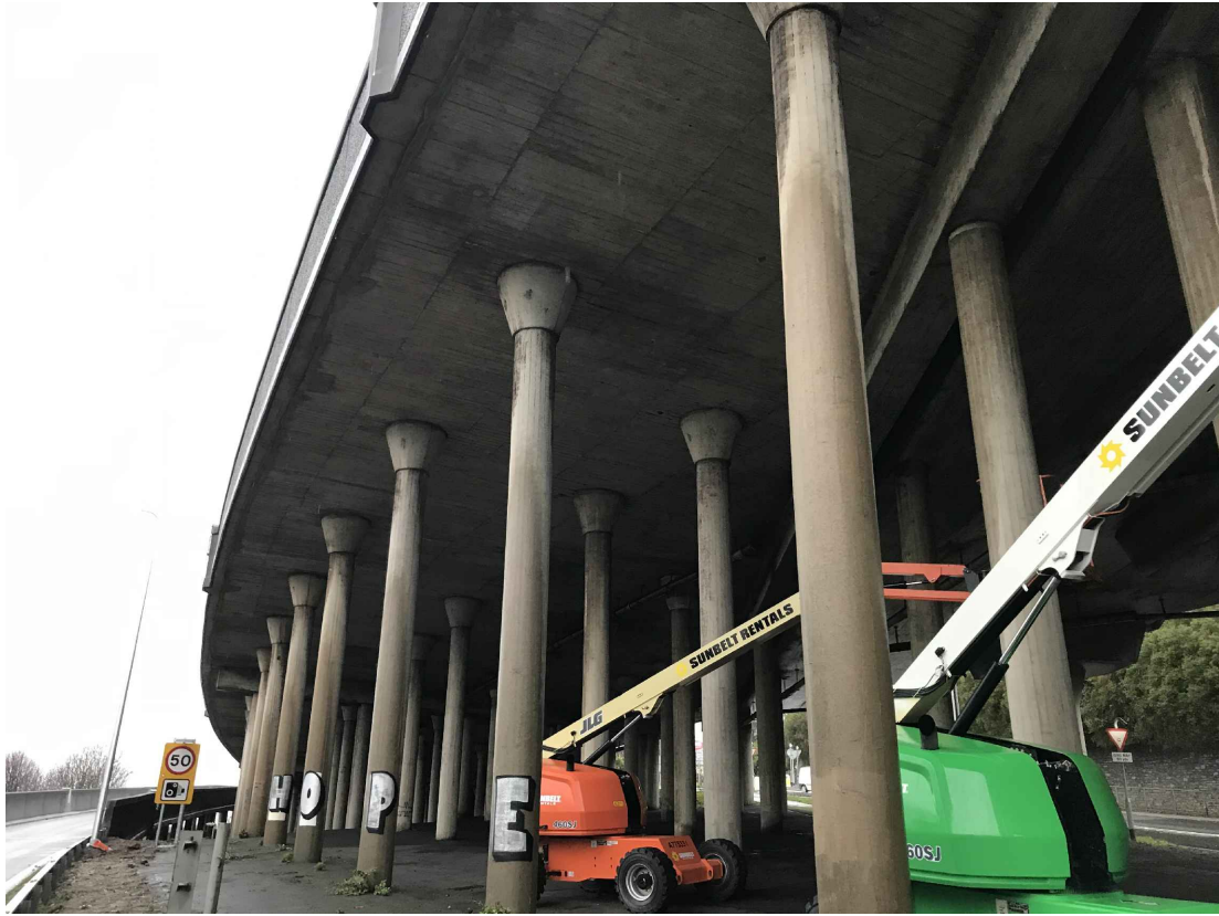
PHOTOGRAPH 4: GENERAL VIEW OF SPAN 9 OF LLEWELLYN ST VIADUCT.