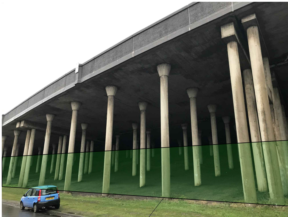
PHOTOGRAPH 3: GENERAL VIEW OF SPAN 5 WITH PROPOSED FENCING.