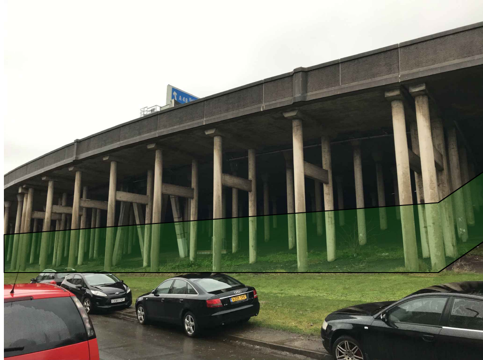
PHOTOGRAPH 4: GENERAL VIEW OF SPAN 6 WITH PROPOSED FENCING.