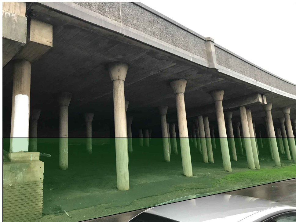
PHOTOGRAPH 1: GENERAL VIEW OF SPAN 3 WITH PROPOSED FENCING.