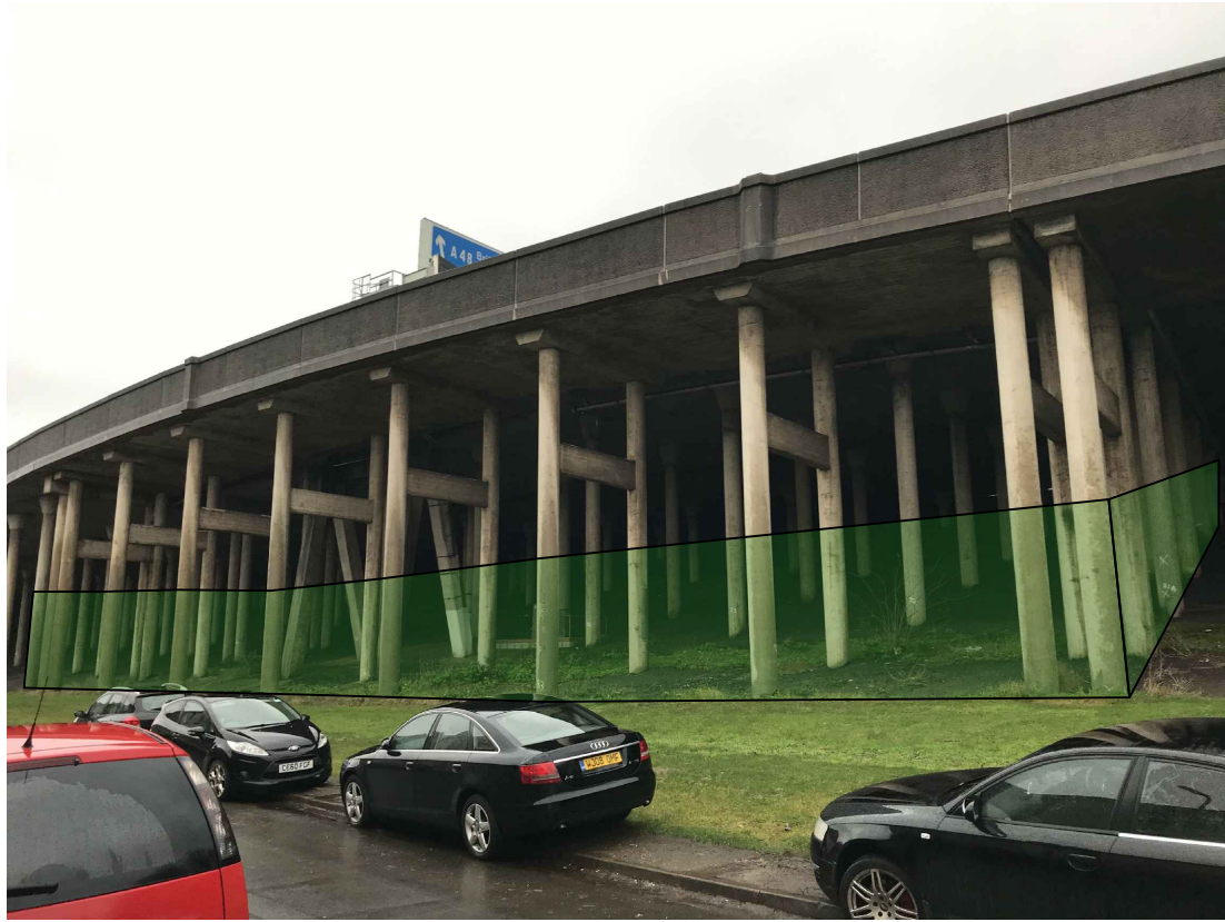
PHOTOGRAPH 1: GENERAL VIEW OF SPAN 6A/6B OF LLEWELLYN ST VIADUCT.