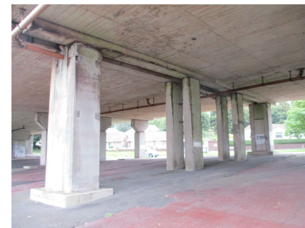
FIGURE 4: GENERAL VIEW OF THE CENTRAL EXPANSION JOINT AND COLUMN ROW 3.