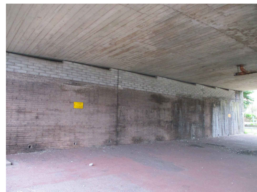
FIGURE 1: GENERAL VIEW OF THE WEST ABUTMENT.