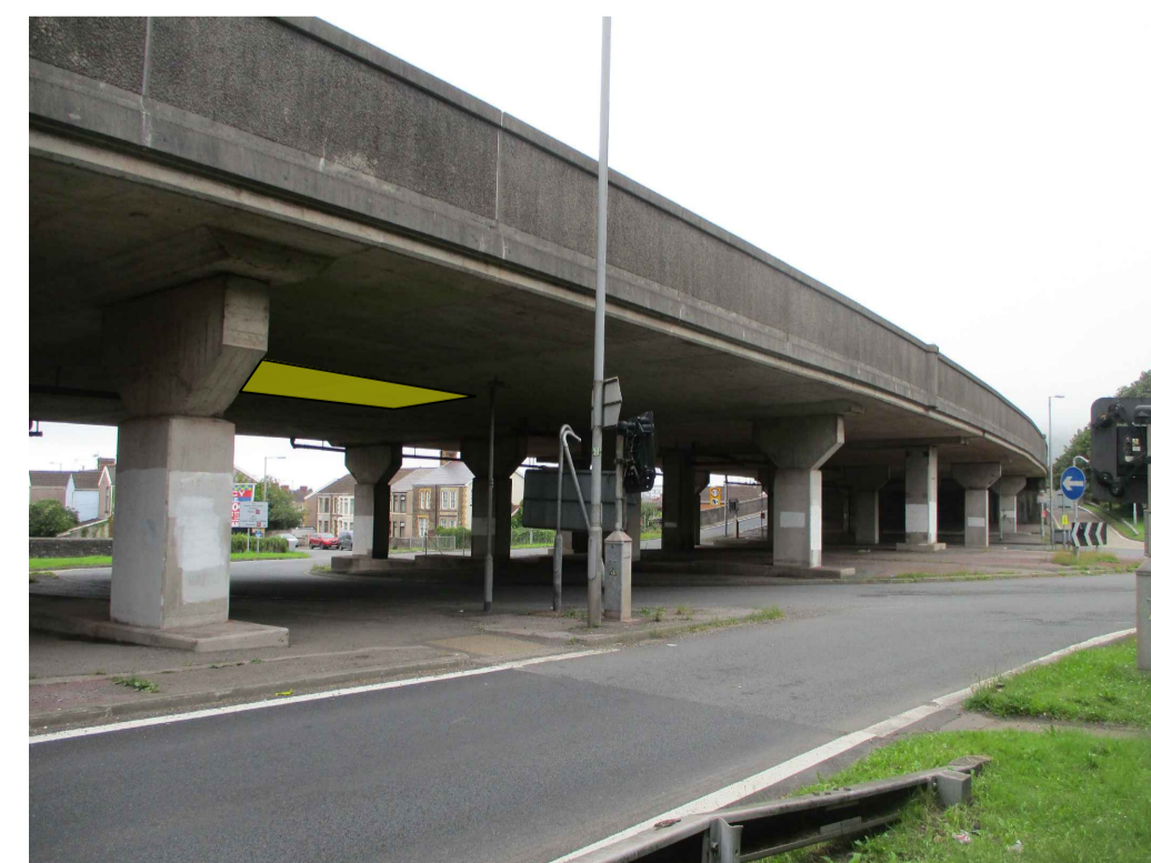
FIGURE 2: GENERAL VIEW OF THE NORTH ELEVATION.