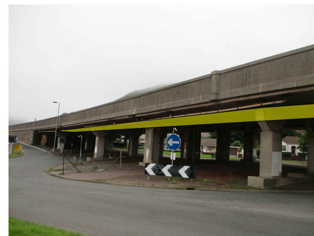
FIGURE 3: GENERAL VIEW OF THE SOUTH ELEVATION AND PROPOSED NETTING.